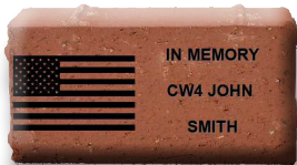
Brick w/ graphic