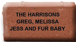
Brick w/o graphic